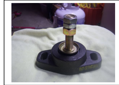
Standard Round Mounts

Hino powered 32xx yachts with 135HP or 150HP diesels that do not have the Hino OEM mounts installed in the front of the engine will suffer excessive vibration at idle speeds. The fix is to purchase and install Hino OEM mounts, Hino part number: S1203-11890. There are a few items to consider before taking on this project. The first is to verify that you have the correct engine brackets necessary to support the Hino OEM Engine mounts. If you have the Angled style mounts then you will need to replace your existing brackets with Hino part number: S1203-11341. If you have the Standard Round Mounts, then the existing brackets will work. Regardless, it will be necessary to modify the Stock engine bracket for most installations. The Stringers on the older 32xx's seem to be higher than the later models. The Hino OEM front mounts are about 3.25 inches high. When you add the adjustment nut the mount will now sit at or about 3.5 inches high. In order to get proper alignment the front of the engine needs to be at or about 3.18 inches. So the motor mount sits too high to allow for proper shaft alignment. In order to get the proper engine height you must modify the Engine brackets. See pictures below of stock Hino Engine Bracket and then a Modified Hino Engine Bracket.