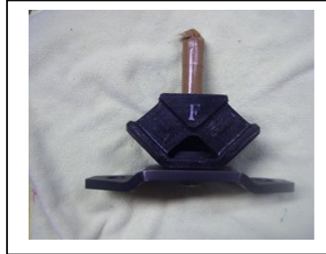
Hino Front Mounts